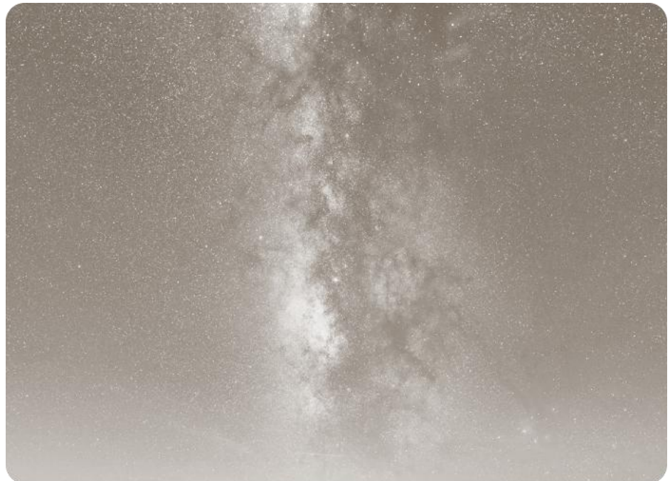
Figure 1.10 Milky Way Galaxy. — Because we are inside the Milky Way Galaxy, we see its disk in cross-section flung across the sky like a great milky white avenue of stars with dark “rifts” of dust. In this dramatic image, part of it is seen above Trona Pinnacles in the California desert.

The Sun is somewhat less than 30,000 light-years from the center of the Galaxy, in a location with nothing much to distinguish it. From our position inside the Milky Way Galaxy, we cannot see through to its far rim (at least not with ordinary light) because the space between the stars is not completely empty. It contains a sparse distribution of gas (mostly the simplest element, hydrogen) intermixed with tiny solid particles that we call interstellar dust . This gas and dust collect into enormous clouds in many places in the Galaxy, becoming the raw material for future generations of stars. Figure 1.10 shows an image of the disk of the Galaxy as seen from our vantage point.