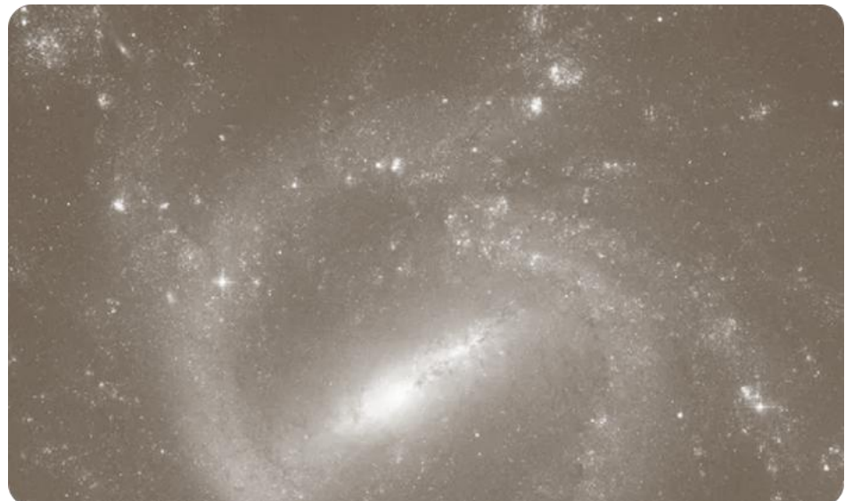
Figure 1.9 Spiral Galaxy. — This galaxy of billions of stars, called by its catalog number NGC 1073, is thought to be similar to our own Milky Way Galaxy. Here we see the giant wheel-shaped system with a bar of stars across its middle.

Our Galaxy looks like a giant disk with a small ball in the middle. If we could move outside our Galaxy and look down on the disk of the Milky Way from above, it would probably resemble the galaxy in Figure 1.9, with its spiral structure outlined by the blue light of hot adolescent stars.